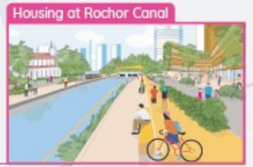
Housing at Rochor Canal