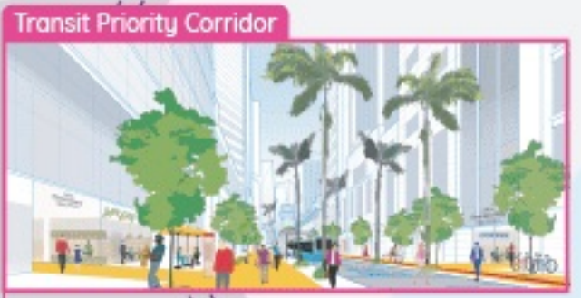
Transit Priority Corridor